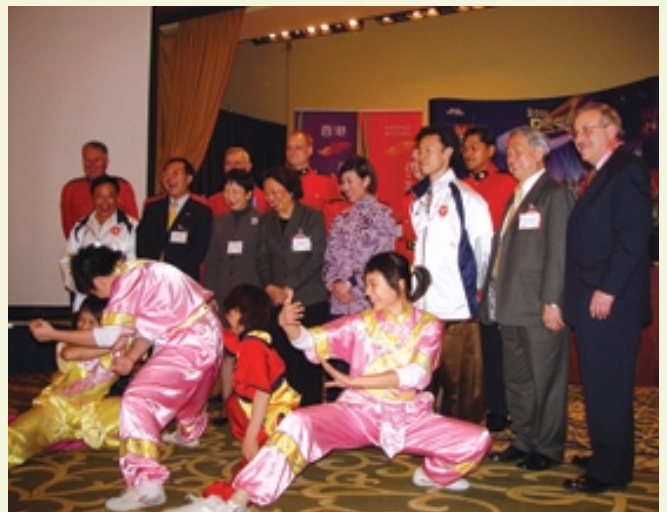
▲ The HKTB links up with the Hong Kong Economic and Trade Office in Canada to promote the Culture & Heritage Celebration in Vancouver 旅發局與駐加拿大香港經濟貿易辦事處於溫哥華合作推廣「傳統節慶巡禮」