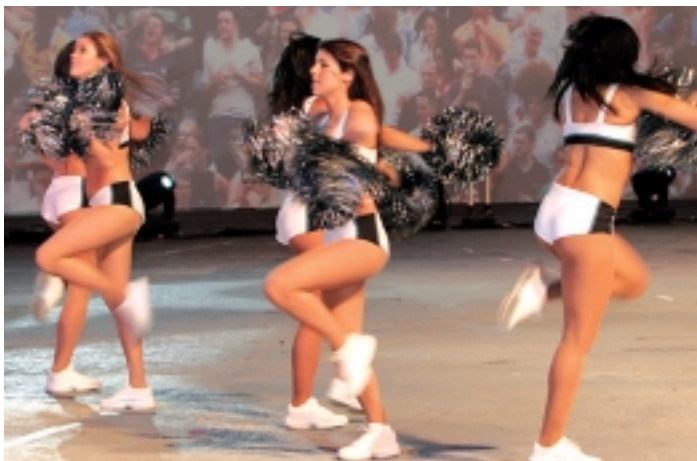
▲ Cheerleaders for the US National Football League's Philadelphia Eagles energise the 2006 Cathay Pacific International Chinese New Year Night Parade

2006年1月，在旅發局主辦的「2006國泰航空新春國際匯演之夜」，來自美國的表演藝人數目刷新紀錄，當中包括美國費城飛鷹啦啦隊、NFL (National Football League) 六隻趣緻可愛的吉祥物，以及美國加州大學步操樂隊。美國國家地理頻道及Discovery Channel亦專程來港採訪這次盛會，在全球營造廣泛的宣傳效應。