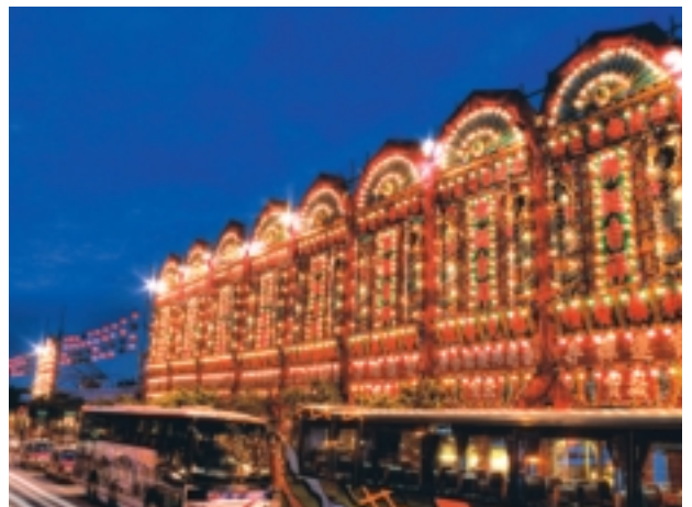
▲ Announced in March 2006, the HKTB's Culture & Heritage Celebration Mega Event is widely promoted in the region 旅發局於2006年3月宣佈舉辦「傳統節慶巡禮」，並在美洲區廣泛推廣