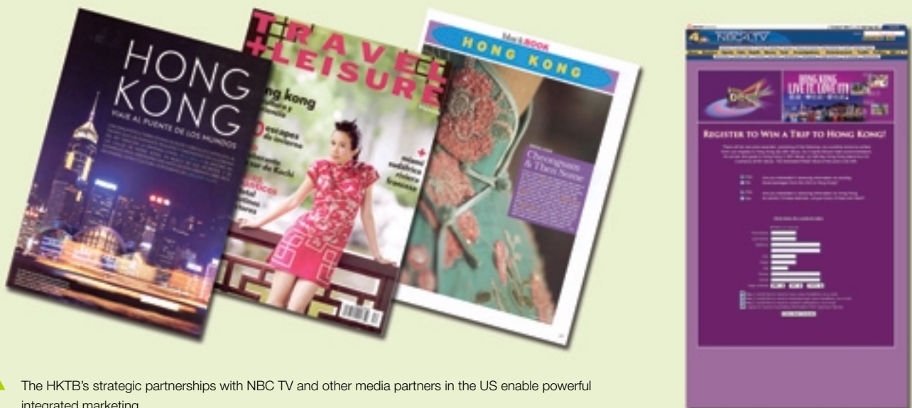
▲ The HKTB's strategic partnerships with NBC TV and other media partners in the US enable powerful integrated marketing 旅發局與美國 NBC TV 及其他傳媒合作，推出強大的綜合推廣活動