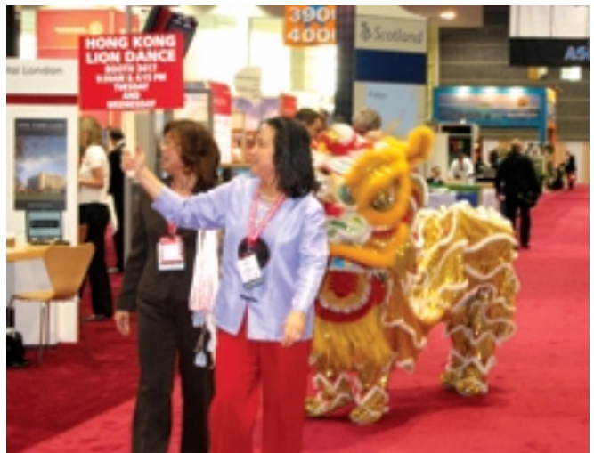
▲ HKTB participation in the IT&ME (Incentive Travel & Meeting Executives) Show in Chicago raises Hong Kong's profile to this high-yield segment 旅發局參與在芝加哥舉行的「獎勵旅遊及會議行政人員展覽」，以提升香港於這個高效益客群的知名度